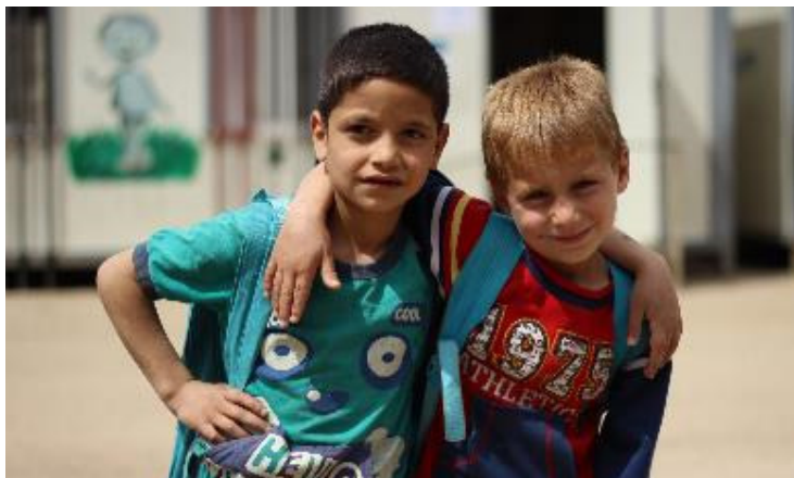
Two boys standing in front of a Primary School made of prefabricated classrooms supported by UNICEF in Aleppo, Syria. The school is located in 1070 neighbourhood, where over 3,000 families displaced by the war seek shelter in unfinished buildings.